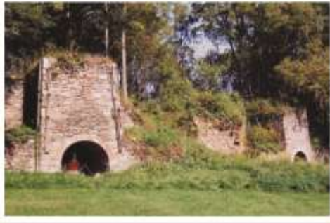
Cromwell Valley historic lime kiln

2. Saturday, April 9, Birding at Cromwell Valley Park, 8:30 A.M. -12 Noon. We will look for early spring migrant birds as well as scope out the ducks on Loch Raven Reservoir. Meet at the Willow Grove parking area.