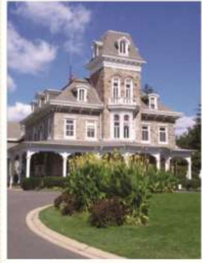
Cylburn Mansion and surrounding gardens is lure for many birds.

2. Saturday, April 9, Birding at Cromwell Valley Park, 8:30 A.M. -12 Noon. We will look for early spring migrant birds as well as scope out the ducks on Loch Raven Reservoir. Meet at the Willow Grove parking area.