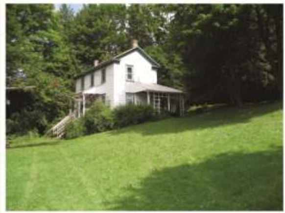
Carey Run Farmhouse

Join us for the weekend in the mountains of Western, Maryland as we stay at a 162-acre bird sanctuary near Frostburg, Maryland. We will visit local state parks to bird. Fee for food, lodging, and park admission. (Approximately $30/person) This trip is limited to 15 persons.