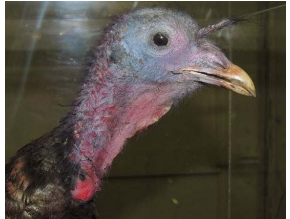
Benjamin Franklin’s Choice for National Bird

Everyone who enters is struck by the Bald Eagle and Wild Turkey displays in the center of the room. And, of course, Baltimore’s team birds, the Raven and Baltimore Oriole, always attract attention. Adult visitors in particular come in with questions about birds at their feeders and Maryland birds in general--their identities, where they can be found, or help in identifying a bird they’ve seen.