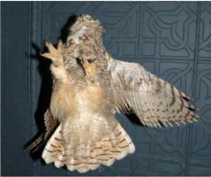
Mouse-eye view of a Barred Owl

Young children thrive on the “hands on” experience of displays at their level. They often need encouragement to touch these objects as parents have taught them not to touch in museums, but they come alive feeling the fur on various skin samples, shaking the rattling seed pods, or making the horse skull chew. One shy four year old who had hesitated to touch anything, when given permission crawled onto the mounted raccoon skin and snuggled against it, pretending to sleep with his new friend!