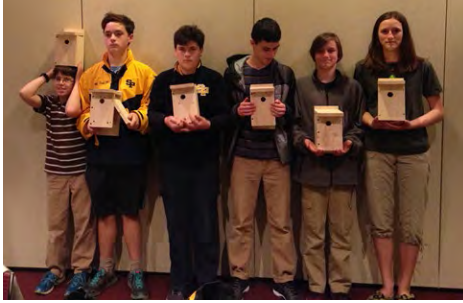
Boy Scouts from Troop 1000 pose with the boxes built that evening

With the help of the troop and students at my high school, Baltimore Polytechnic Institute, we constructed thirteen nest boxes, with entrance holes ranging in size from 1" to 1 1/2", designed for common species like House Wrens and Carolina