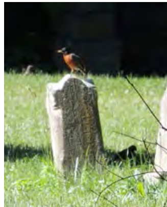
American Robin at St. Peter's Cemetery