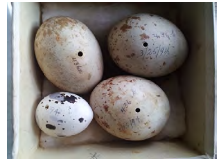
Unidentified eggs in the Cylburn collection

As though I were entering a time tunnel, each creaky step of the stairway took me deeper into the 19th century as I climbed up to the hot and dusty third floor of the old Cylburn mansion. An enormous mounted moose head greeted me as I entered the attic office of the Baltimore Bird Club. The office was packed with mounted birds and containers of rocks, shells and animal skulls. I continued through another door to a smaller room, minding my head as I walked over three stairs to enter an anteroom containing two metal cabinets and a smaller cabinet of drawers. I opened the display cabinet and very carefully slid out the top drawer. Before me were hundreds of delicate multicolored and speckled eggs tucked neatly into little open boxes packed with soft cotton. I wondered whose hands might have held these eggs more than one hundred years earlier. I was hooked.