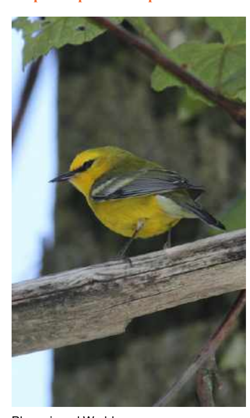
Blue-winged Warbler