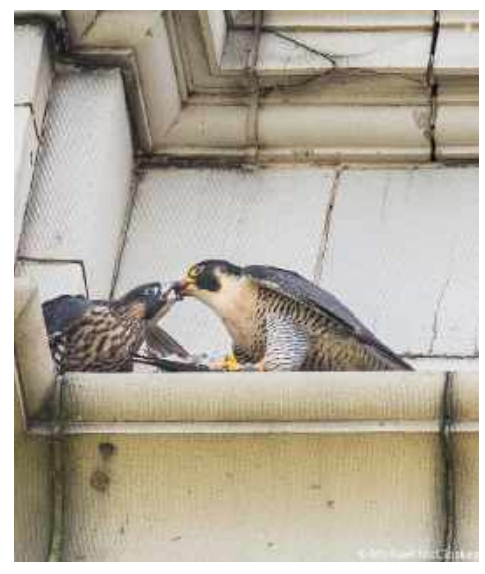
Peregrine Falcon Mom Feeding Fledgling

Peregrine Falcons in flight are faster than I can catch with a camera, but they have been making some complicated moves of late. Two of the youngsters will fly parallel to each other and then roll to the side with their talons almost touching, as if playing at fighting. This afternoon I saw Dad training one of the youngsters to catch food in mid-flight, a necessary skill for an aerial hunter. Dad flew in a comfortable circle around the tower carrying a nice piece of food. The youngster followed; Dad flew a bit higher and slower so that he was above the youngster and then dropped the food. The youngster reached out with its talons and missed, but by this time Dad was beneath his offspring and caught the food before it had fallen far. OK,