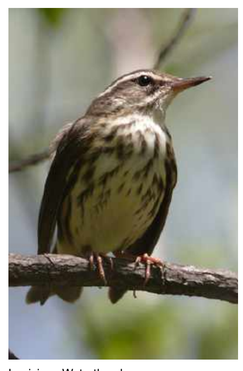
Louisiana Waterthrush