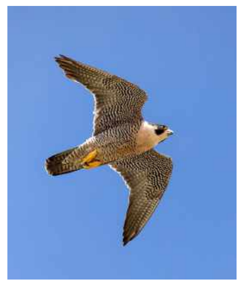
The adult female Peregrine Falcon passed away on July 1st