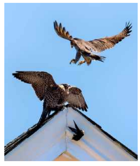
Peregrine Falcons Fumble Hand-Off

Postscript: As of this writing (late July), all the juveniles, including Junior, have "flown the coop," so to speak. The father returns to the Tower and can still be seen in the early morning and late afternoon.