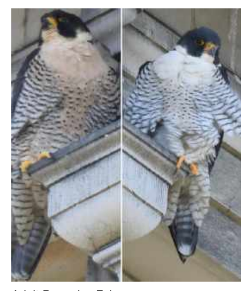
Adult Peregrine Falcons