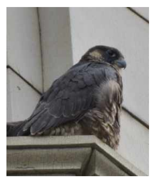
Juvenile Peregrine Falcon perched on the ledge