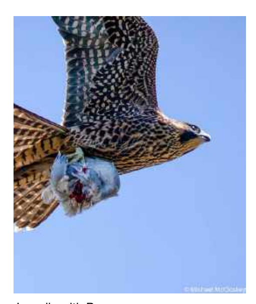
Juvenile with Prey