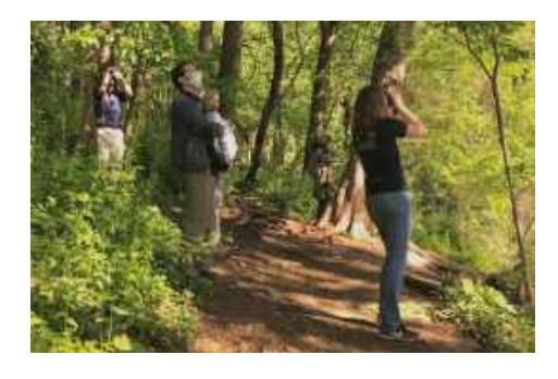
Pandemic birders enjoying a phenomenal spring migration at Wyman Park.

Not only did sound pollution drop during the quarantine, air pollution did, too, not surprising since there was little motorized traffic or industry taking place. A University of Minnesota School of Public Health study analyzed air quality data for the continental United States between the dates of March 13 and April 21, 2020, specifically focusing on particulate matter, PM2.5, and nitrogen dioxide levels. Particulate matter is tiny particles of solid or liquid suspended in a gas, increased levels of which can be linked to health issues, particularly cardiac and respiratory problems. Nitrogen dioxide is produced from