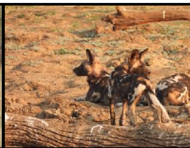
Endangered African Painted Dogs (formerly Wild Dogs)