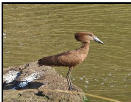
Hammerkop (related to Pelicans and the Shoebill, it's known for its enormous stick nests)