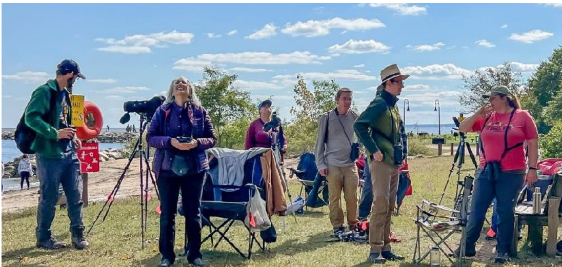
Big Sit at North Point State Park

Thanks to all for making the Big Sit a success! Here is the link to the checklist: https://ebird.org/checklist/S120301088