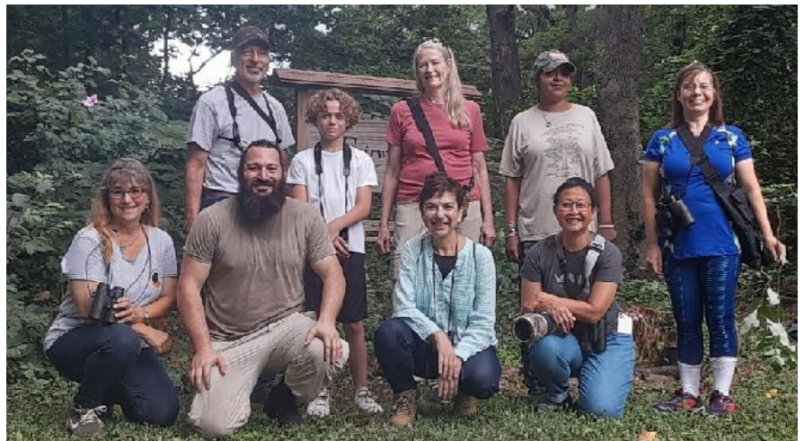
A good and informative banding session