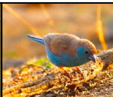
Southern Cordonbleu at a Watering Hole