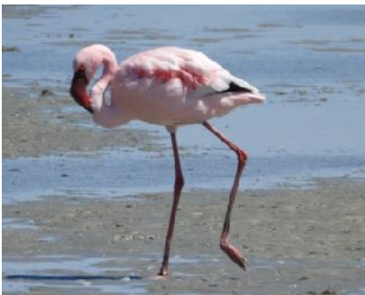
Lesser Flamingo on the flats

The Apartheid Museum and Soweto Monuments in Johannesburg were a must for me, along with Nelson Mandela's house. After a long and bitter struggle, and with worldwide protest against apartheid (South Africa's version of our Jim Crow segregation) apartheid ended in SA in 1994. In Soweto, in July of 1976, up to 700 high school students (exact figure still unknown) were killed, and many more injured, by police in a brutal repression of a 20,000 strong student protest of the Afrikaans Medium Decree, which forced all black schools to use especially Afrikaans as the language of instruction. Mandela spent 27 years in prison for opposing the apartheid system, then became the president of South Africa!