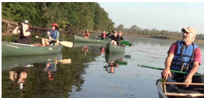
Birding from a canoe at Days Cove

One of the first chilly Autumn mornings meant both the birders and the birds were slow to warm up. As the sun first hit the top of the tree-line we started seeing warbler activity and it didn't slow down. The previous nights had favorable winds and brought in many new migrants, notably Red-breasted Nuthatch, Ruby-crowned Kinglet, an early Swamp Sparrow, and nine warblers species throughout the day. The first half of the walk was along the Torrey C. Brown Rail Trail, ending at the Ashland Flats overlook, where we found Solitary Sandpiper, both Yellowlegs, Great Blue Herons, and a Great Egret. From there, we moved down the road to the Paper Mill Flats trail hoping for a variety of shorebirds. While shorebirds were thin, both Yellowlegs again and a few Killdeer, we were treated to a great, mixed flock of warblers towards the end. We racked up 56 species between the two hotspots, and with a few participants getting their lifer Wilson's and Bay-breasted warblers.