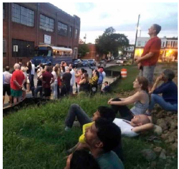
Observing Chimney Swifts, Photo by Alice Greely Nelson