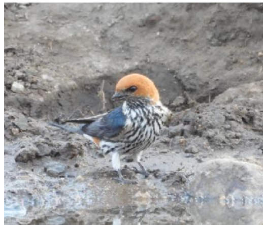
Lesser Striped Swallow