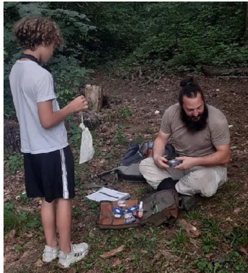
Holding the bird to be banded quietly in a soft bag