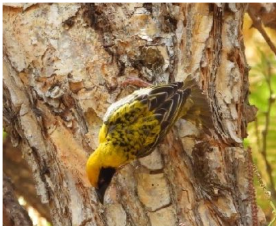
Village Weaver (Weavers are named for their nest building habits)