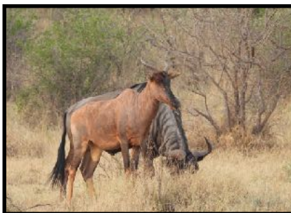
Tsessebe and Blue Wildebeast (Tsessebe can run 56mph)

I'm definitely going back to Africa before it's all over. Magical!