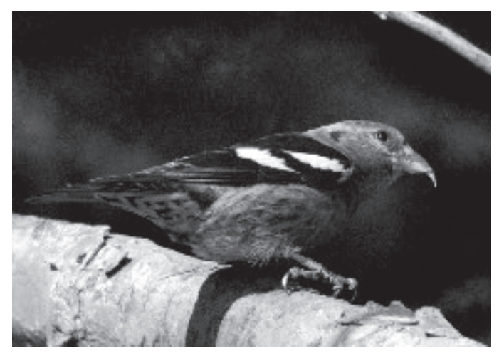
White-winged Crossbill (m) Druid Ridge Cemetery — February 1st 2009

http://ebird.org/content/ebird/news/got-white-winged-crossbills